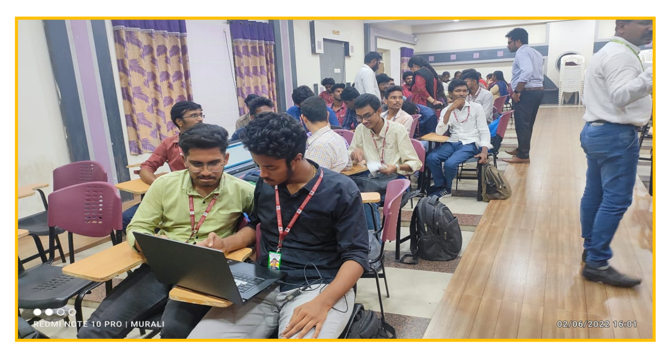
Students participating in projects using IoT kit

The next session began with how the proliferation of connected devices and the Technology capabilities is transforming the industry with cloud data. He also discussed the various areas of Arduino Board analytics application, Installation of Arduino Software and functions.